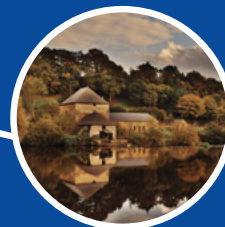
PAYS DE LA LOIRE